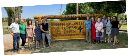
Navajo Nation Trip 2024

Grab a coffee... and gather in the Loft right after worship.